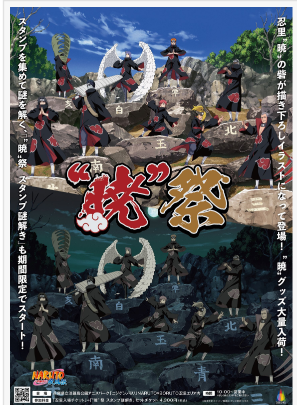
Akatsuki Festival: Stamp Rally

The "Akatsuki Festival: Stamp Rally", a limited-time event where guests collect stamps while solving riddles scattered throughout the attraction, will launch an English version from Saturday, November 5. In the Akatsuki Festival: Stamp Rally, guests will explore the attraction and solve a series of riddles to win a reward. Once guests have collected all stamps from the riddle-solving, they will receive one of six original B3-sized posters of their choice.