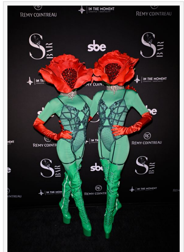
House of Leaves performance artists at S Bar Las Vegas

The laissez-faire atmosphere of 'Late Affair' programming will entice everyone to explore their