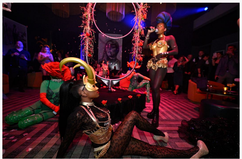
A musical performance by House of Leaves at S Bar Las Vegas

Located in the heart of Mandalay Bay Resort and Casino, S Bar Las Vegas is open five nights a week, as well as for private events. Hours of operation are Tuesday-Thursday, 5pm - 12am, and Friday 5pm - 2am and Saturday, 5pm - Late Night (6am). The “Late Affair” experience officially begins November 5 and will run until approximately 6am. Follow @SbarLasVegas for updates and special programming news.