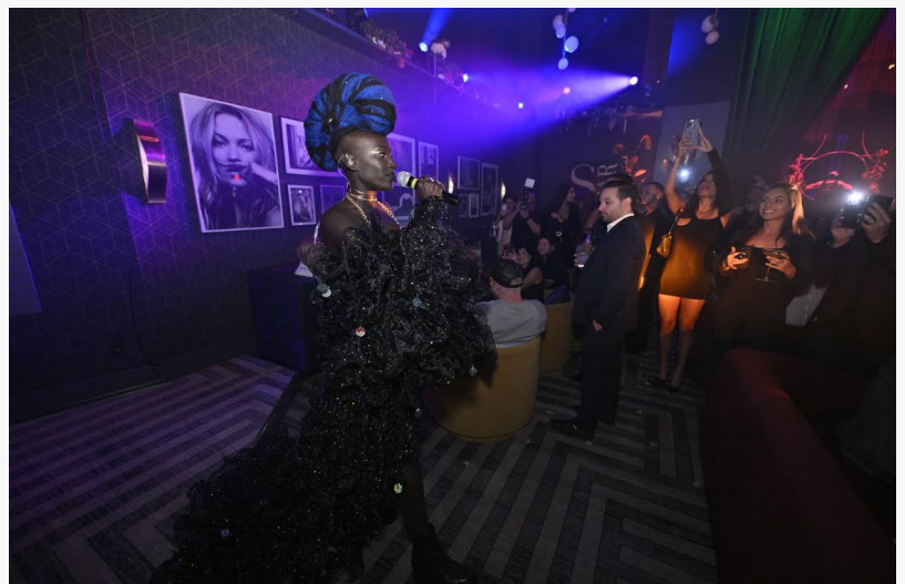
A musical performance by House of Leaves at S Bar Las Vegas