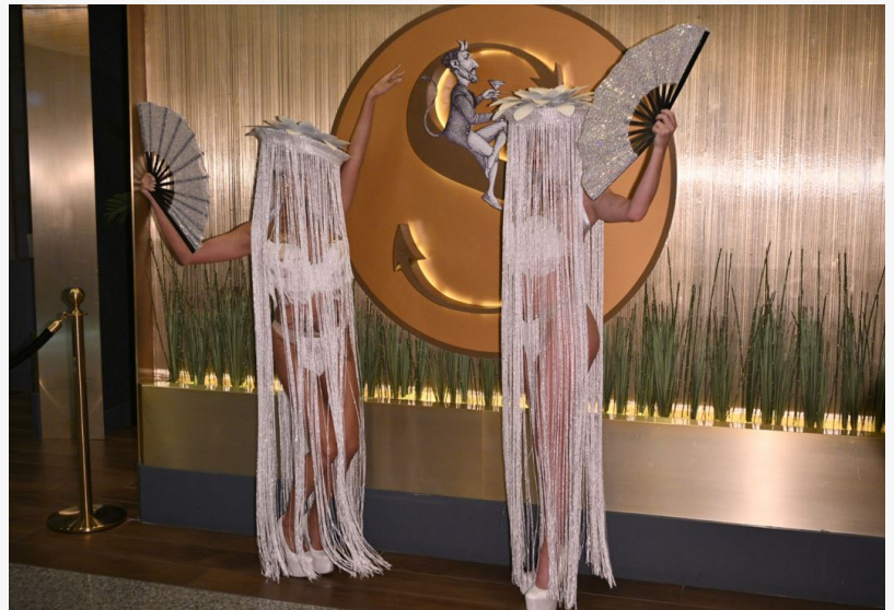
House of Leaves performance artists at S Bar Las Vegas

For more information, please visit https://www.sbe.com/nightlife/s-bar/las-vegas Follow on Facebook and Instagram @Sbarlasvegas, @InTheMomentLV