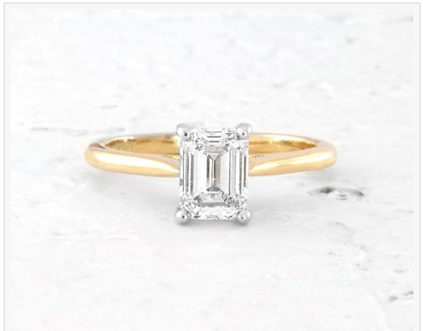
Emerald Cut Solitaire Ring