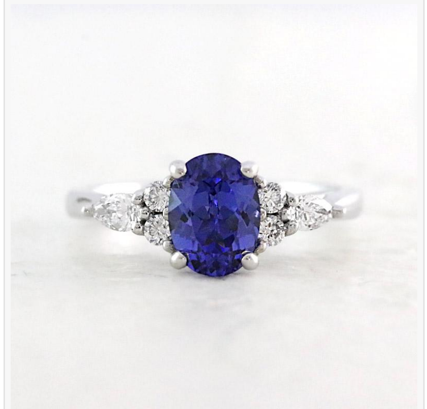
Sapphire And Diamond Ring