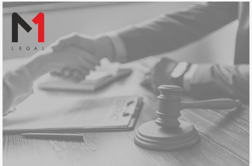
M1 Legal: Changing lives

For one couple from Northwood in North West London, October 2022 brought a welcome conclusion to years of misery due to an illegally sold Marriott