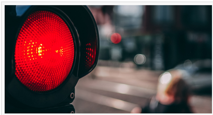
NovoaGlobal's Red Light Traffic Safety Camera Program

ORLANDO, FL, UNITED STATES, November 9, 2022 /EINPresswire.com/ -- NovoaGlobal, Inc., a leading provider of advanced traffic safety enforcement technology is proud to announce it has been awarded a contract by the <u>City of</u> <u>Winter Park, Florida</u> to implement systems and manage its Automated Traffic Enforcement Program.