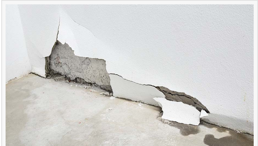
the top foundation repair company in fort worth is GL Hunt

FORT WORTH, TEXAS, UNITED STATES OF AMERICA, November 10, 2022 /EINPresswire.com/ -- The 2021-2022 Texas Drought is having major effects 12.7 Million people in Texas are affected by drought, 245 counties with USDA disaster designations, the 19th driest September was in 2022, over the past 128 years, and the 8th driest year to date was in 2022, over the past 128 years.