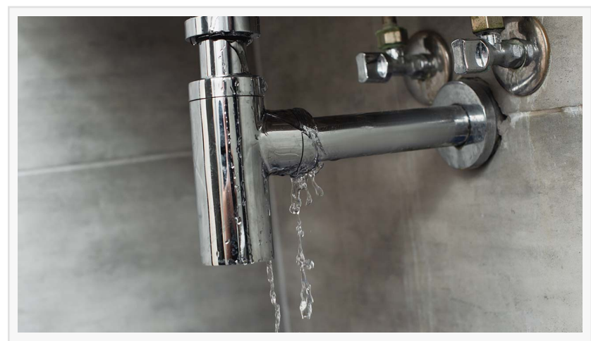
the best slab repair company in dallas texas