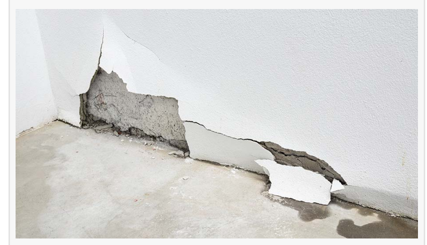
the top foundation repair company in dallas texas