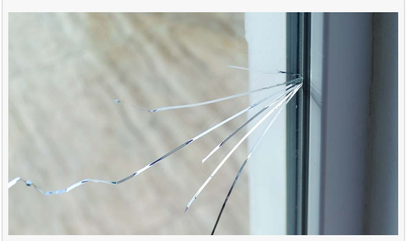
best dallas texas slab repair company

Texas has seen a significant state-wide increase in Foundation and Slab Repair requests due to the 2021-2022 Drought in Texas. According to <a href="https://gov.texas.gov/news/post/governor-abbott-renews-drought-disaster-declaration-in-october-2022">https://gov.texas.gov/news/post/governor-abbott-renews-drought-disaster-declaration-in-october-2022</a> The following counties have been declared disaster areas: Andrews, Aransas, Archer, Atascosa, Austin, Bandera, Bastrop, Baylor, Bee, Bell, Bexar, Blanco, Borden, Bosque, Brazoria, Brazos, Brewster, Brown, Burnet, Caldwell, Calhoun, Callahan, Castro, Childress, Clay, Cooke, Coleman, Collingsworth, Colorado, Comal, Comanche,