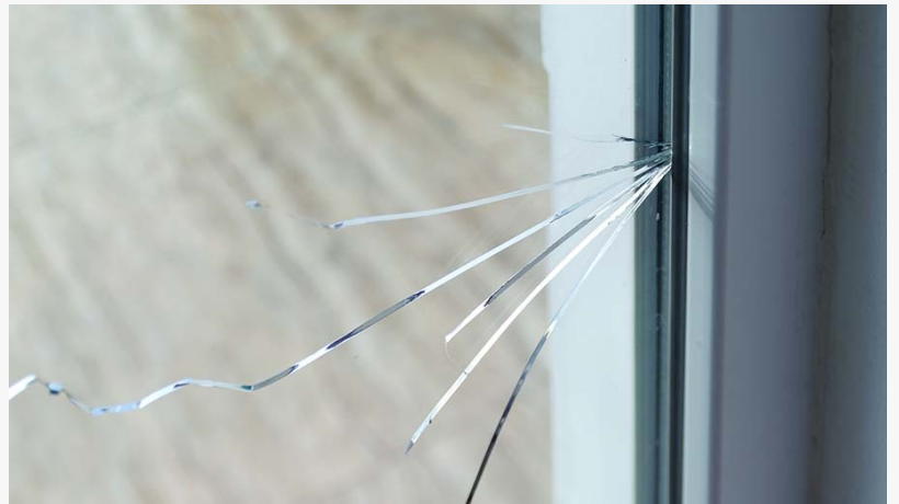
best San Antonio Texas slab repair company