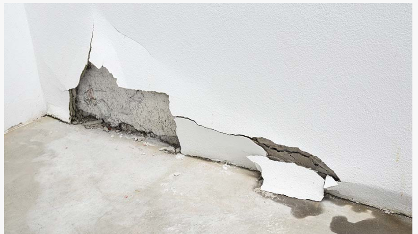
best foundation repair company in San Antonio Texas