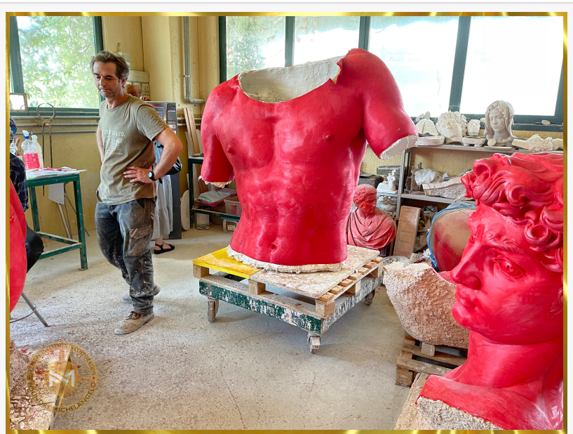
The Torso and Head of David in Red Wax with master artisan from Foundry Marinelli in Florence, Italy reinforced with special plaster for secure transport