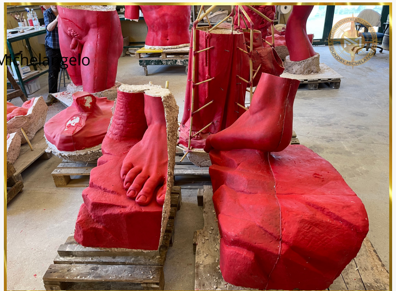
Foundry Marinelli in Florence, Italy showcasing the beginning steps to the arduous creation of an Original Michelangelo Masterpiece

This press release can be viewed online at: https://www.einpresswire.com/article/599891484 EIN Presswire's priority is source transparency. We do not allow opaque clients, and our editors try to be careful about weeding out false and misleading content. As a user, if you see something we have missed, please do bring it to our attention. Your help is welcome. EIN Presswire, Everyone's Internet News Presswire™, tries to define some of the boundaries that are reasonable in today's world. Please see our Editorial Guidelines for more information.