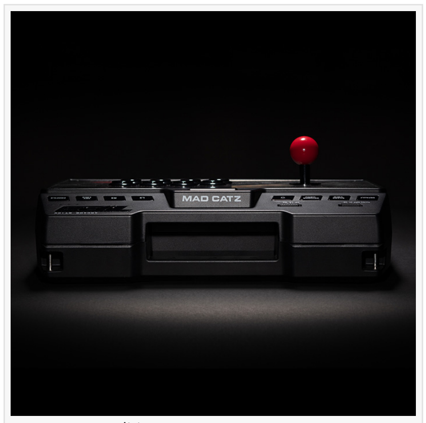
Tournament Edition 3

KOWLOON, HONG KONG, November 7, 2022 /EINPresswire.com/ -- Mad Catz Global Limited, a leading innovator in gaming hardware, is pleased to announce our new Tournament Edition 3 Arcade Fight Stick. The T.E.3 Arcade Fight Stick is the third version of the iconic Mad Catz Tournament Edition series. As with previous versions, the T.E.3 features the classic Sanwa Denshi buttons delivering an authentic arcade experience with the legendary quality and durability of Sanwa components. This latest iteration features enhanced multi-platform compatibility, improved