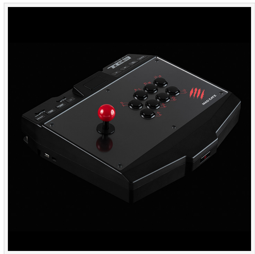
Classic Sanwa Components

For additional information about Mad Catz and its products, please visit <a href="https://www.madcatz.com">www.madcatz.com</a>. You can also find out more online through Mad Catz' Twitter, Facebook, YouTube, Instagram, TikTok, and LinkedIn.