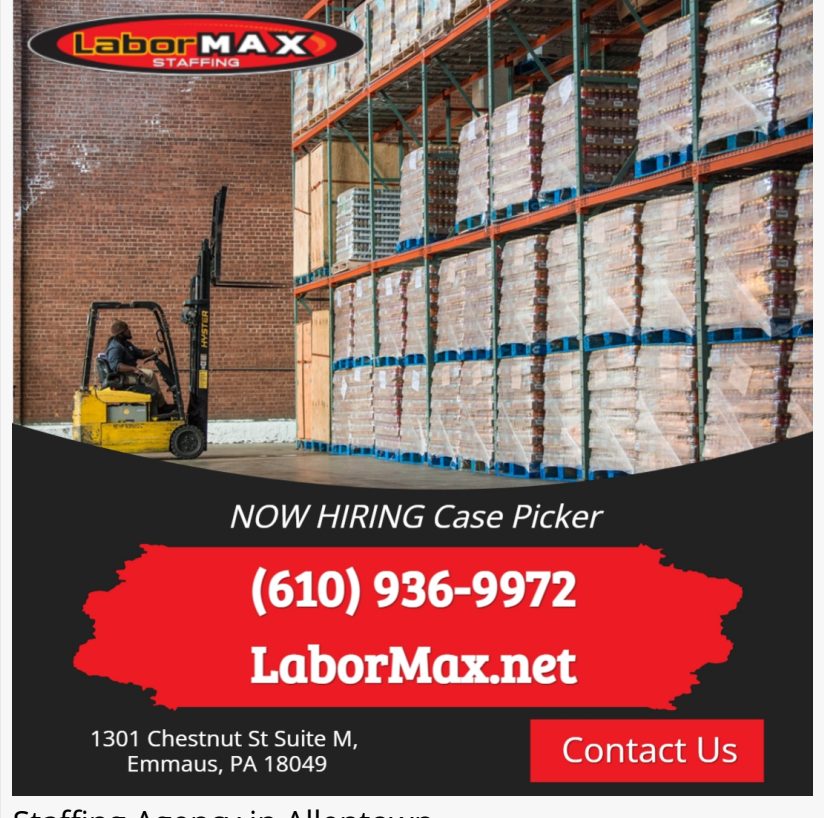
Staffing Agency in Allentown