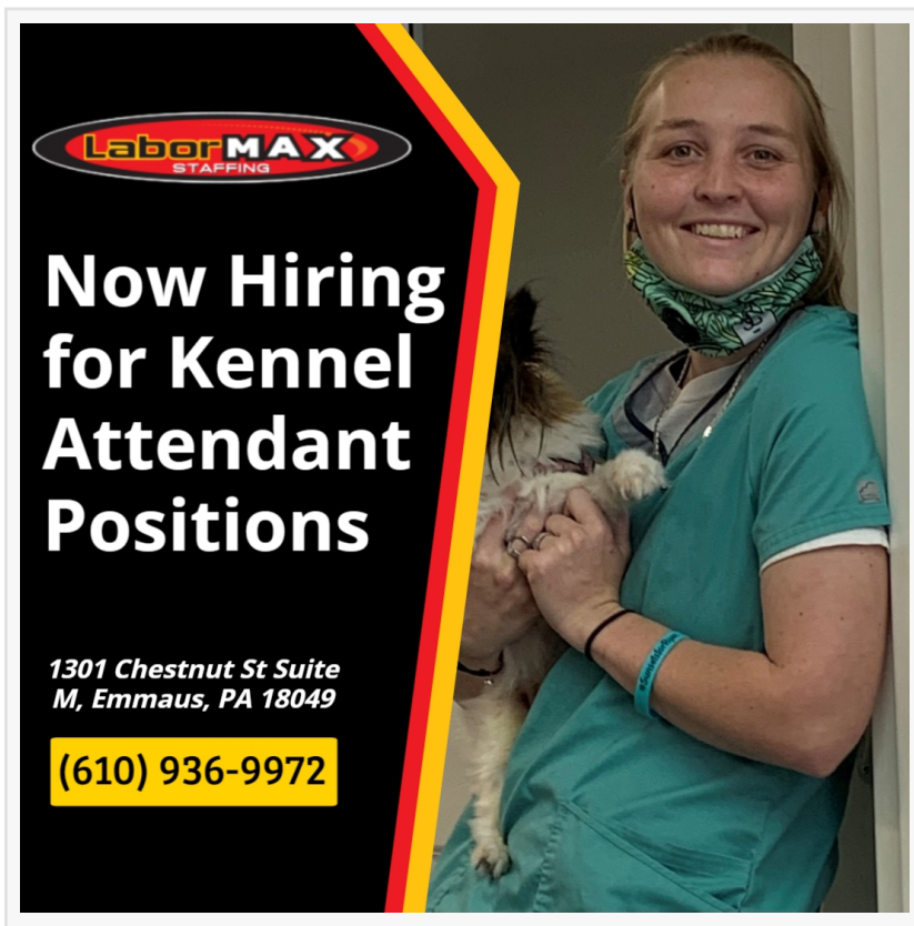
Hiring in Allentown

Although, there are 9 steps all together, LaborMax Staffing of Allentown did add addition step for optimizing productivity with using Allentown temporary staffing services. "Flexibility is the key to thriving during uncertain times—and our temporary staffing services can help you reach your goals. As one of the top warehouse temp agencies in the country, LaborMax can help you keep up with the time. With the current supply chain issues facing America today, warehouses need to become more strategic about how they operate," Ramirez added.