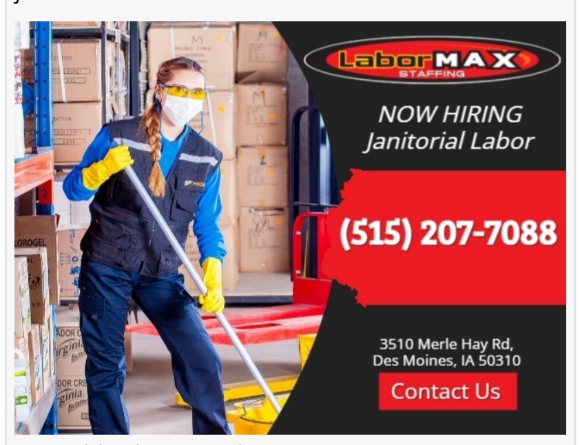
Now Hiring in Des Moines