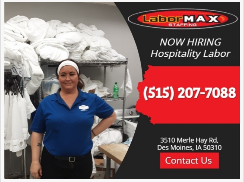
jobs in Des Moines

For more information regarding LaborMax Staffing in Des Moines or all nine steps in optimizing warehouse productivity, please visit <u>labormax.net</u> or call (515) 207-7088. Companies and the public can also visit LaborMax Staffing's location at 3510 Merle Hay Rd, Des Moines, IA 50310.