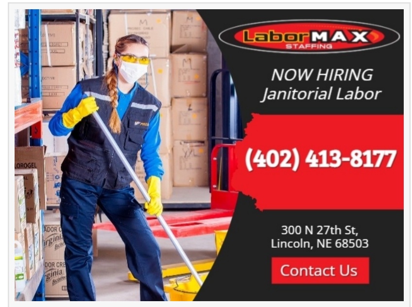
jobs in Lincoln

Although, there are 9 steps all together, LaborMax Staffing of Lincoln did add addition step for optimizing productivity with using Lincoln temporary staffing services. "Flexibility is the key to thriving during uncertain times—and our temporary staffing services can help you reach your goals. As one of the top warehouse temp