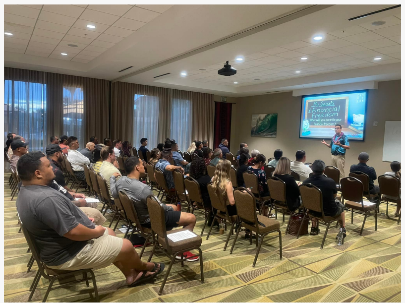
Hawaii Cash-Flow Breakfast Club