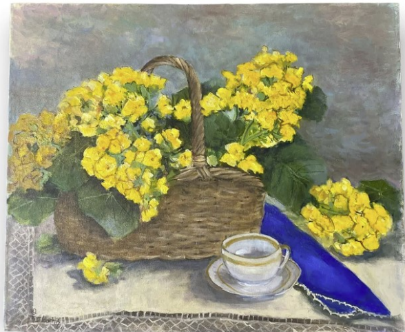
Bette Lou Voorhis