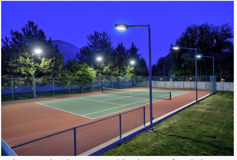
Indoor pool with a retractable glass roof and glass walls

Agents will be compensated according to the information listed on the property page. See Auction Terms and Conditions for full details. For more