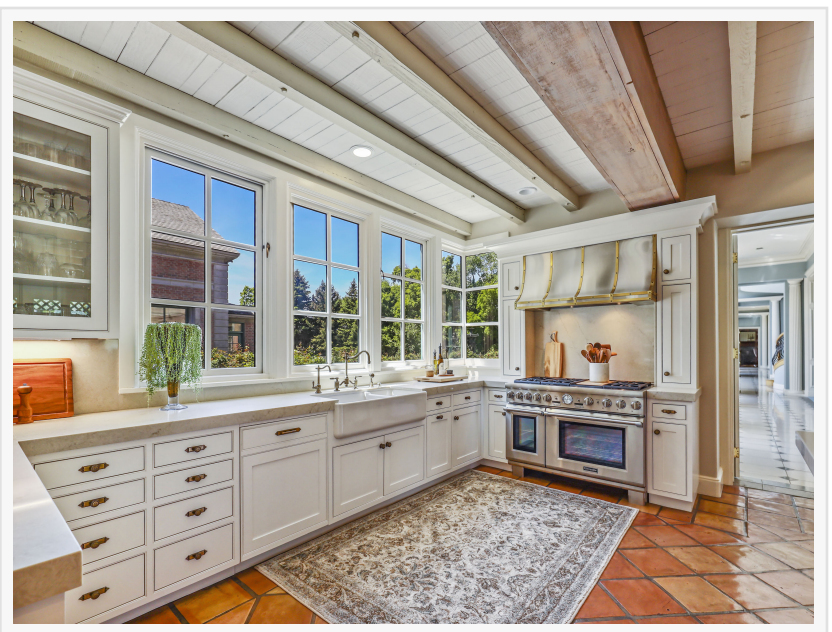
Grand hall and gallery maximizing natural lighting

The 18,178 square foot estate sits on 4.34 acres of land. <u>255 West 3300</u> <u>North Street</u> boasts ten bedrooms, five full bathrooms, two three-quarter bathrooms, and three half bathrooms. The home brags vaulted truss ceilings with mezzanine over the great room, a grand serpentine staircase, engaged columns, and French doors. Inside,