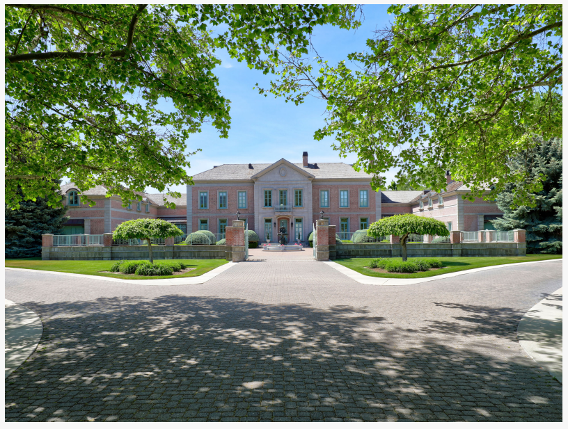
Stunning 2000+ square foot master suite

interior is filled with natural light, from the gourmet chef's kitchen to the living area with a