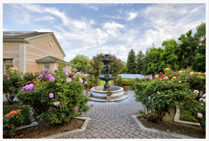
Gorgeous wood-paneled library with rolling ladders

discover seven fireplaces, a gourmet chef's kitchen with a butler's pantry, and abundant natural light throughout. The primary suite has 2 fireplaces, a jetted tub, sauna, and his/her walk in closets. Outside you can find a full-size tennis court, seven outdoor patios, landscaped lawns, two fountains, two koi ponds, a gazebo, and a well. The property contains five garage spaces and a two-bedroom separate apartment.