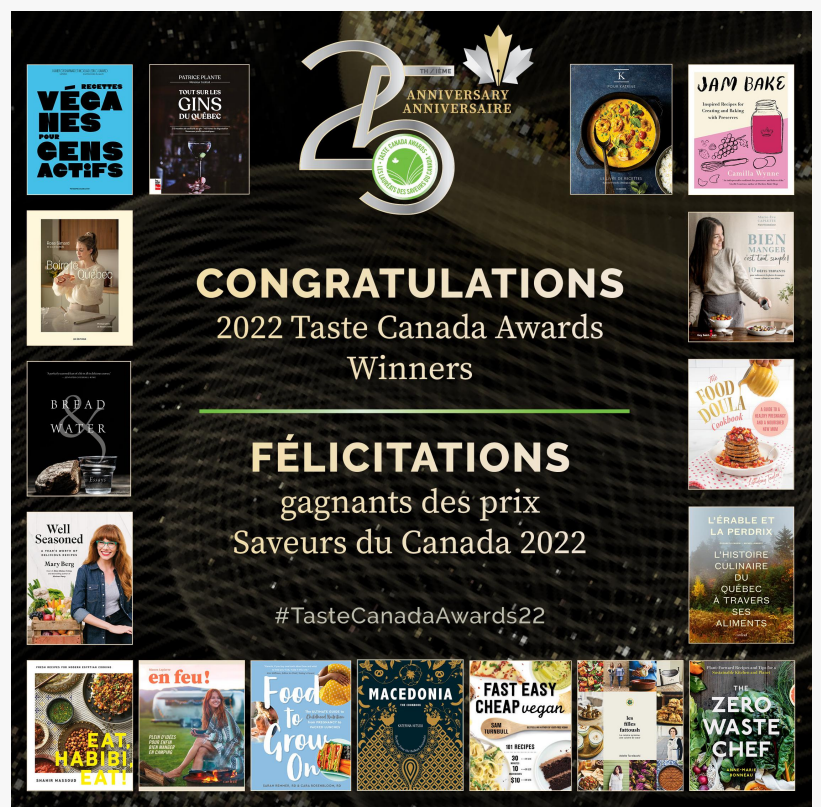
2022 Taste Canada Winners