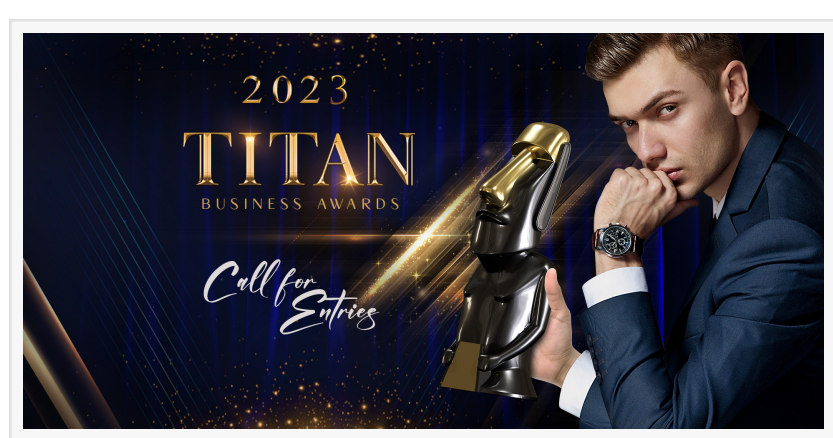
2023 TITAN Business Awards Call For Entries

NEW YORK CITY, NY, UNITED STATES, November 10, 2022 / EINPresswire.com/ -- As means of recognizing the achievements and positive contributions of entrepreneurs, professionals, and