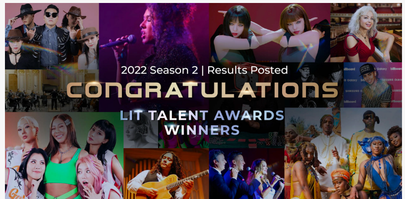
2022 LIT Talent Awards S2 Winners Announced

After strict and unbiased evaluations of all available performances, the LIT Talent Awards is proud to present the most sought-after title of 2022, the LIT of the Year to: Saweetie – Fast