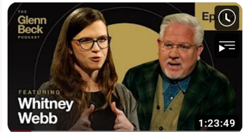
How Elites Will Create a New Class of Slaves | Whitney Webb | The Glenn... The Glenn Beck Podcast | Ep. 162 | Nov. 6, 2022

"Whitney did a very deep dive into history with her book, ONE NATION UNDER BLACKMAIL. We