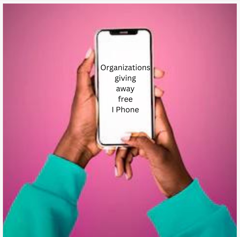
Free government Iphone for low income families

EINPresswire.com/ -- It seems like every day People hear about a new government program that's giving away free iPhone programs . Should Someone want to be a part of this trend? If so, it's important to first understand the pros and cons. Government-provided iPhone programs can have a few benefits, but they also come with some drawbacks. To avoid any hassle it is always recommended to visit a reputed online resource to verify about the program or organization. there are plenty of online resources such as getgovtgrants , Grantswatch , grant verifier , government web portals . Let's take a closer look at each one.