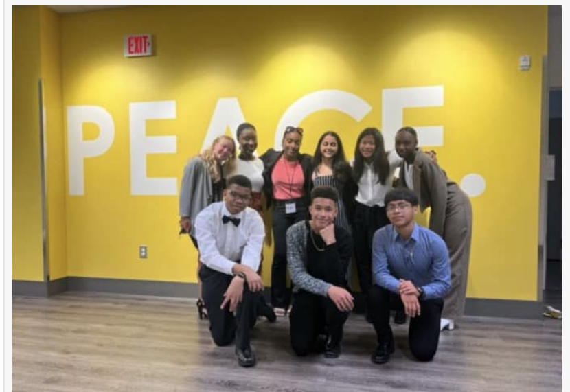
Youth Leadership Class 2022