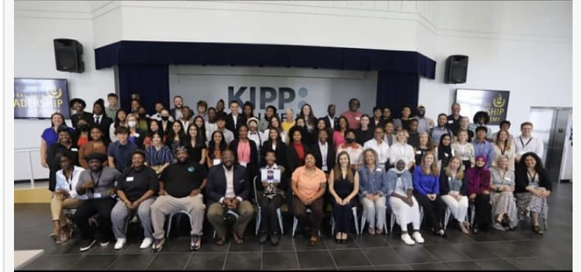
Youth Leadership Class 2022