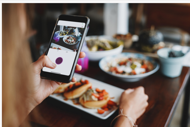
GiftAMeal App in Action

Founded in 2015, GiftAMeal is a free mobile app that helps provide a meal to a family in need in a restaurant's local community every time a user takes a photo of their order from a partner restaurant. Through over 500 established restaurant partnerships, the GiftAMeal program has helped provide over a million meals to those in need across 25 states — one smile at a time. The