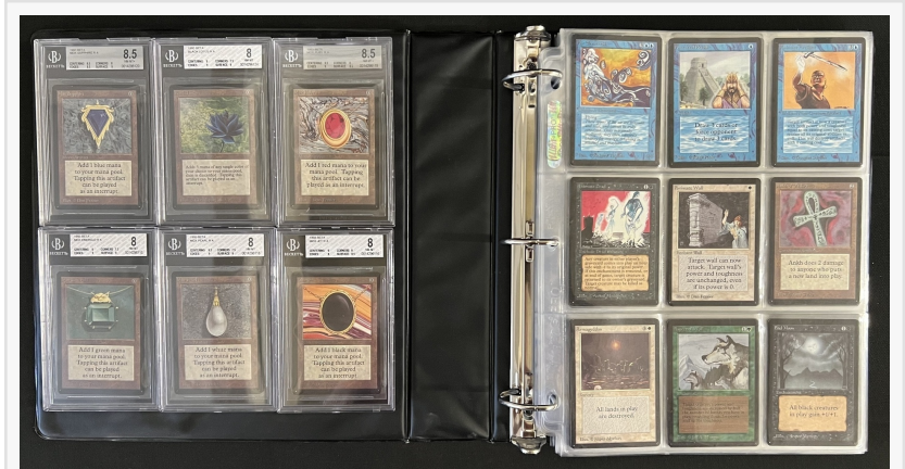
Complete Magic: The Gathering "Beta" card set from 1993, just the second set for "MTG" with a print run of only 3,200 rare cards, with six cards graded by Beckett ($120,000).

LYNBROOK, NY, UNITED STATES, November 9, 2022 /EINPresswire.com/ -- A complete Magic: The Gathering "Beta" card set from 1993, just the second set for "MTG" with a print run of only 3,200 rare cards, sold for a staggering $120,000 in an online-only Comics, Comic Art, MTG Booster Boxes & More auction held October 19th by Weiss Auctions, based in Lynbrook. Three other Magic: The Gathering lots cracked the top 20.