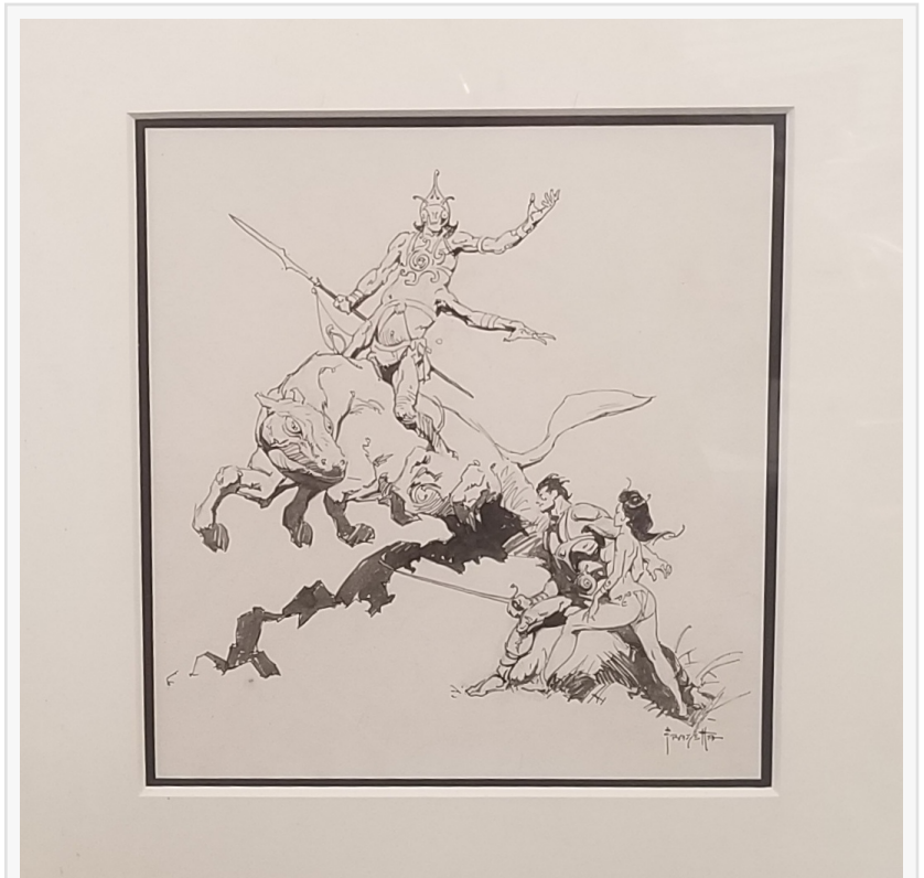
Original pen and ink book illustration by Frank Frazetta for the Doubleday edition of A Princess of Mars by Edgar Rice Burroughs, artist signed ($36,000).

A rarely seen copy of Detective Comics #29 from 1939, featuring just the second-ever Batman cover, with an appearance by Dr. Death in the first of a two-part story, cover art by Bob Kane, fetched $32,400. Also, an original pen and ink book illustration by Frank Frazetta for the Doubleday edition of A Princess of Mars by Edgar Rice Burroughs, artist signed, hit $36,000.