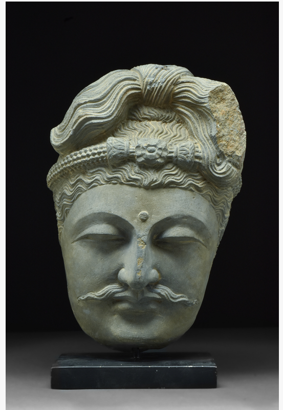
Gandharan carved grey schist head of Bodhisattva displaying ultimate in Kushan artistry, circa 200-300 AD. Estimate: £3,000-£6,000 ($3,485-$6,970)

Several exceptional examples of painted pottery lead the impressive array of ceramics. A very rare Apulian red-figure column krater, executed by a Rodin painter, dates to circa 380-360 BC and is richly illustrated with a scene that includes warriors, an elegantly adorned woman holding