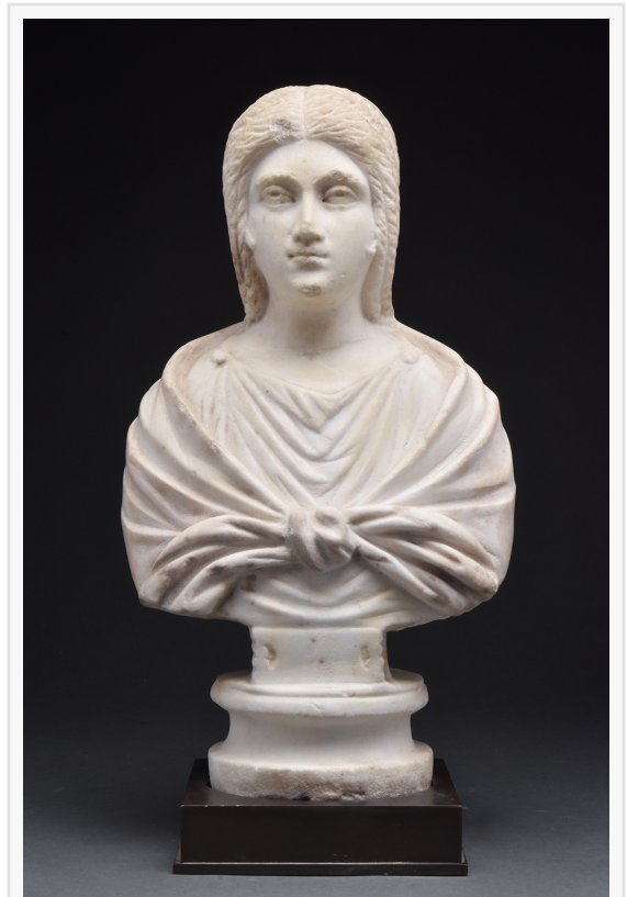
Roman Imperial marble bust likely depicting Empress Julia Domna, wife of Septimius Severus late 2nd century AD. Estimate: £15,000-£30,000 ($17,415-$34,830)

Apollo Art Auctions is located in a newly expanded gallery at 25 Bury Place in the heart of London's Bloomsbury district, opposite The British Museum. Their Nov. 13, 2022 auction will commence at 7 a.m. US Eastern Time/12 noon BST. View the fully illustrated auction catalogue and sign up to bid absentee or live online through LiveAuctioneers. The company accepts payments in GBP, USD and EUR; and ships worldwide. All packing is handled by white-glove specialists in-house. Questions: call Apollo Art Auctions, London, on +44 7424 994167 or email info@apollogalleries.com . Online: www.apolloauctions.com