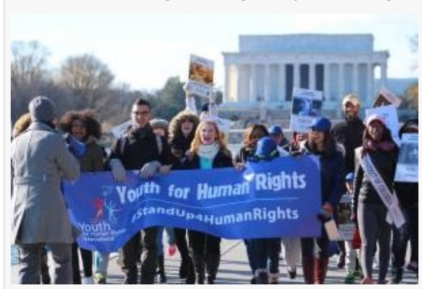
Youth marching at the Lincoln Memorial in Washington, DC, to promote human rights