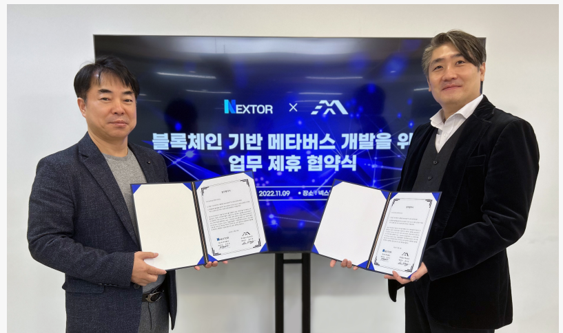
Business partnership agreement

In particular, Exais' Zemi-World will open its service website on November to reveal the progress of Zemiverse development and actual play videos. In addition, the website will provide various