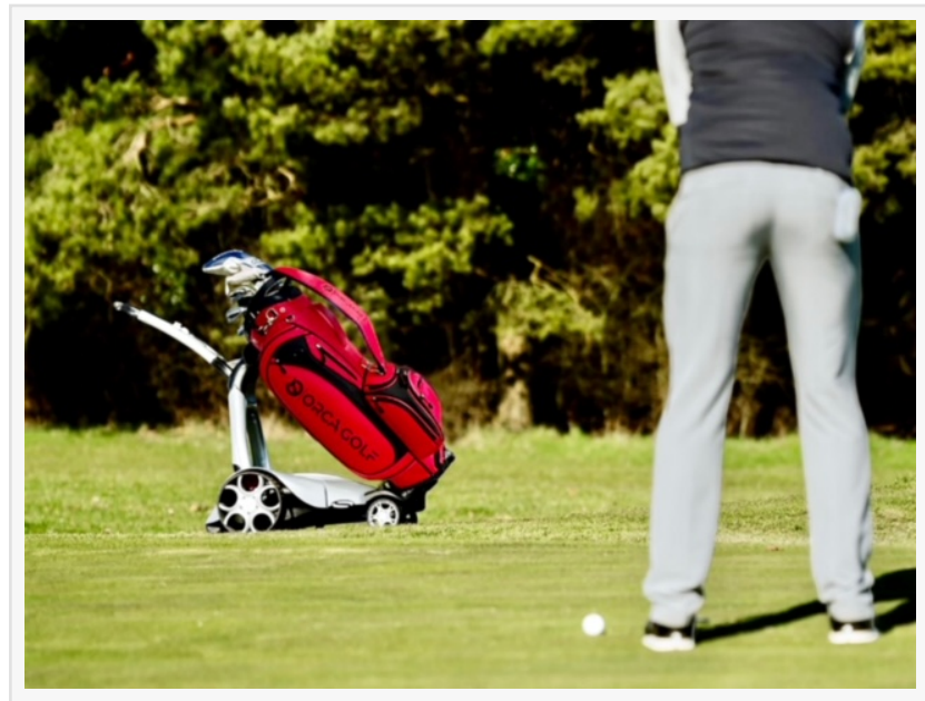
ORCA GOLF AND UK'S #1 MOTORIZED CADDIE COMPANY, STEWART GOLF CREATE A PARTNERSHIP

In recent times, Stewart Golf has continued to go from strength to strength. In 2022, Stewart Golf was included in the Sunday Times Fastest 100 Growing UK Businesses list, for its stellar growth over the last 3 years. Firmly established as the 'Leader In Follow', their innovative caddies use