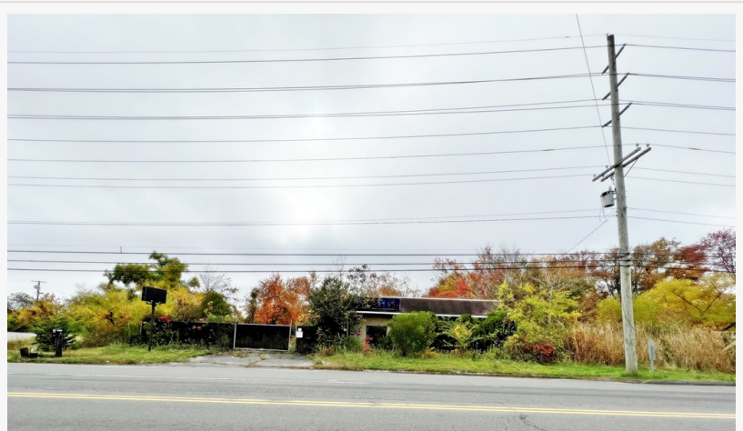
East Delilah Rd, GC Zone