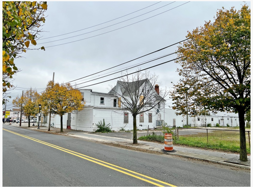
North Main Street, CBD Zone

PLEASANTVILLE, NJ, USA, November 11, 2022 /EINPresswire.com/ -- Max Spann Real Estate & Auction Co. is pleased to announce the upcoming Government ordered Surplus Real Estate Auction on December 8th by order of the City of Pleasantville , New Jersey. The municipality is converting tax repossessed properties from government owned to privately owned. This accomplishes many goals including putting non-revenue producing assets back on the tax rolls, reducing Municipality liabilities, and taking fallow properties and having the private sector put them to use. NJ Statute N.J.S.A. 40A:12-13(a). requires that Municipalities put their properties no longer needed for public use up for public auction. Anyone can bid on the properties as long as they adhere to the terms of the sale.