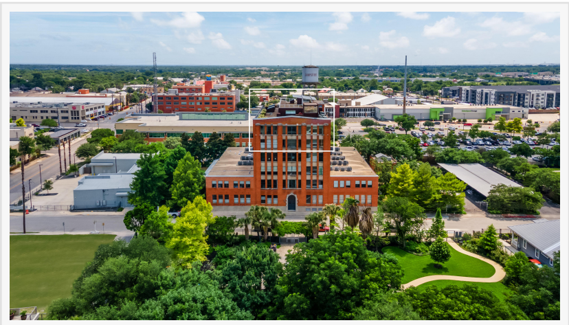
Over 15,000 square feet of interior space across two floors

You will find this one-of-a-kind Penthouse that also appears to double as an art installation in San Antonio's historic arts district, Southtown. Just past the hustle and bustle of downtown, you'll find Southtown.