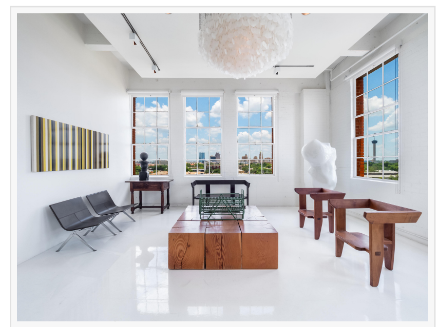
The home also has auxiliary art storage compromised of over 2,000 feet completely separate from the unit

Perhaps the most unique art in all of Southtown can be found inside The Collector's Penthouse at 114 Camp St. Comprised of over 15,000 interior feet across the top two floors of the building, the home was designed and finished by one of Texas' most prominent collectors and philanthropists, Linda Pace. Suited to showcase the most sought-after collections, the home does this