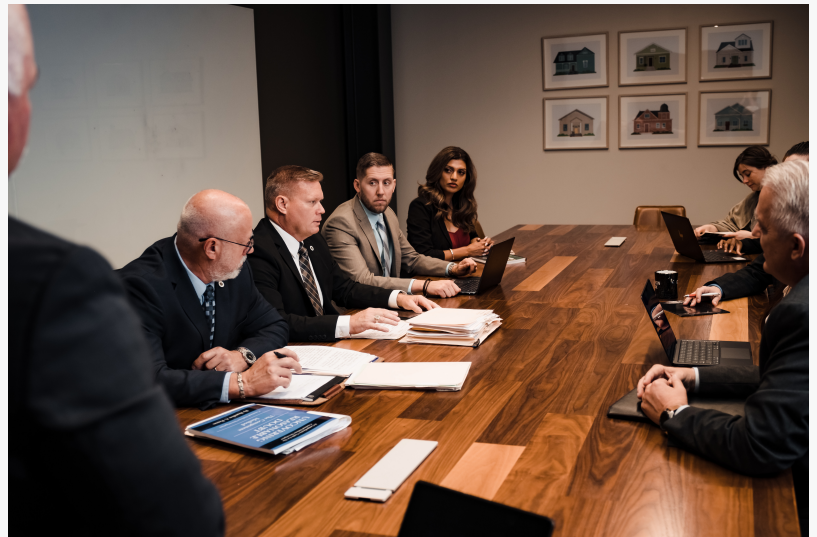
Blackfish Intelligence meeting

This press release can be viewed online at: https://www.einpresswire.com/article/600675965 EIN Presswire's priority is source transparency. We do not allow opaque clients, and our editors try to be careful about weeding out false and misleading content. As a user, if you see something we have missed, please do bring it to our attention. Your help is welcome. EIN Presswire, Everyone's Internet News Presswire™, tries to define some of the boundaries that are reasonable in today's world. Please see our Editorial Guidelines for more information.