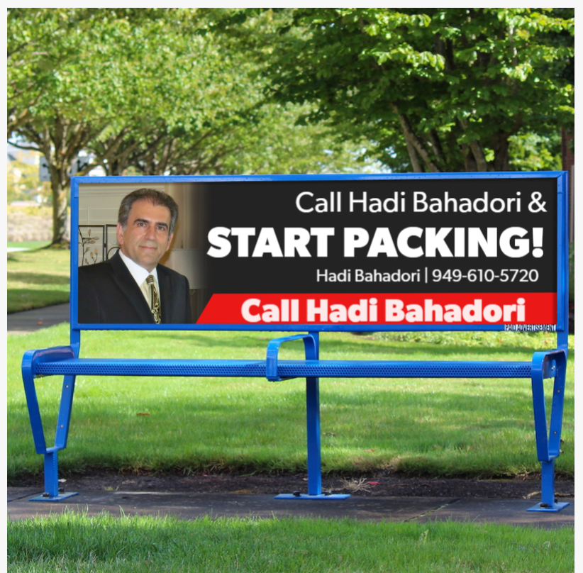
Discount Realtor Beverly Hills Ca