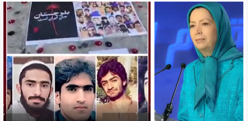
Iranian opposition the National Council of Resistance of Iran (NCRI) President-elect Maryam Rajavi praised the Iranian people for their solidarity with their brethren in Zahedan and Sistan & Baluchestan Province.