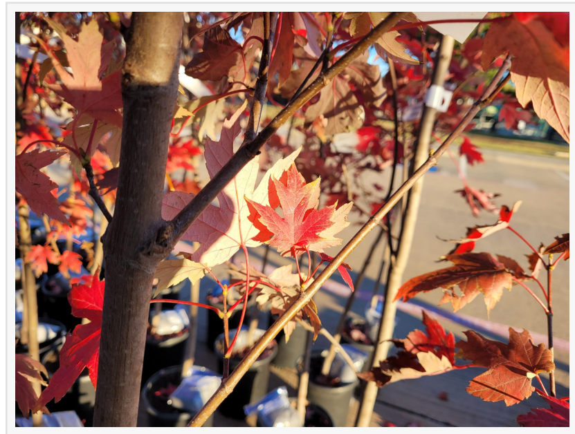
200 trees were given away to residents including Southern magnolia, Japanese maple, among others.

For more information on Texas Trees Foundation, visit <a href="www.texastrees.org">www.texastrees.org</a>. You can also follow Texas Trees Foundation on Instagram at <a href="www.instagram.com/texastreesfoundation">www.instagram.com/texastreesfoundation</a>, on Facebook at