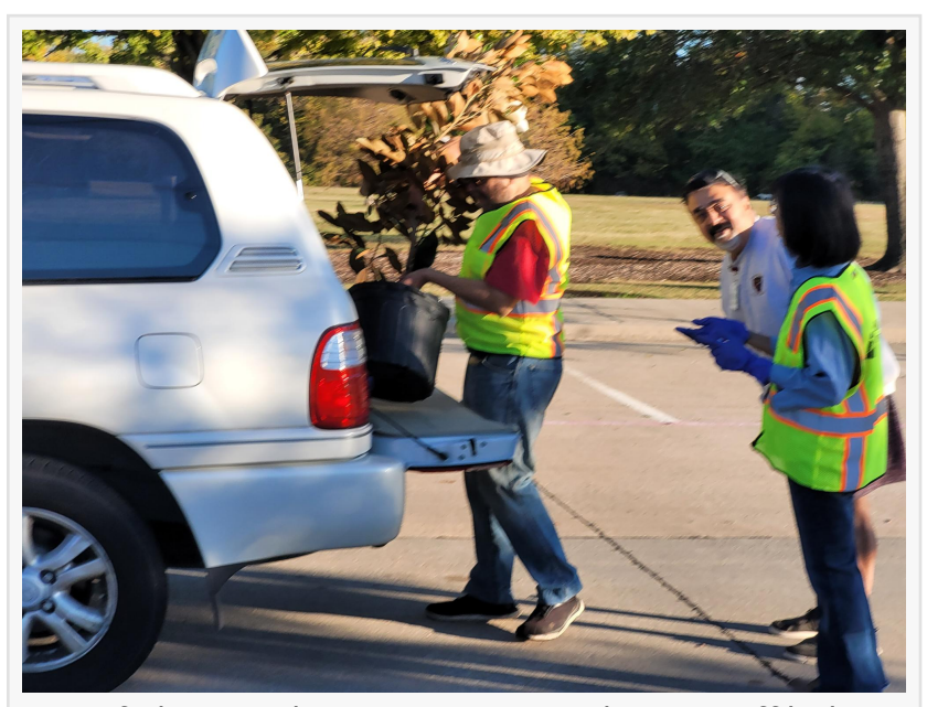
City of Plano and Texas Trees Foundation staff help residents get trees into cars.

The City of Plano partnered with <u>Texas</u> <u>Trees Foundation</u> to giveaway 200 free trees at the city's Texas Arbor Day event.