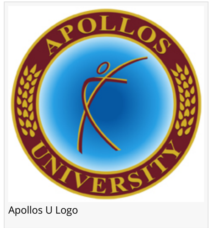
Apollos U Logo