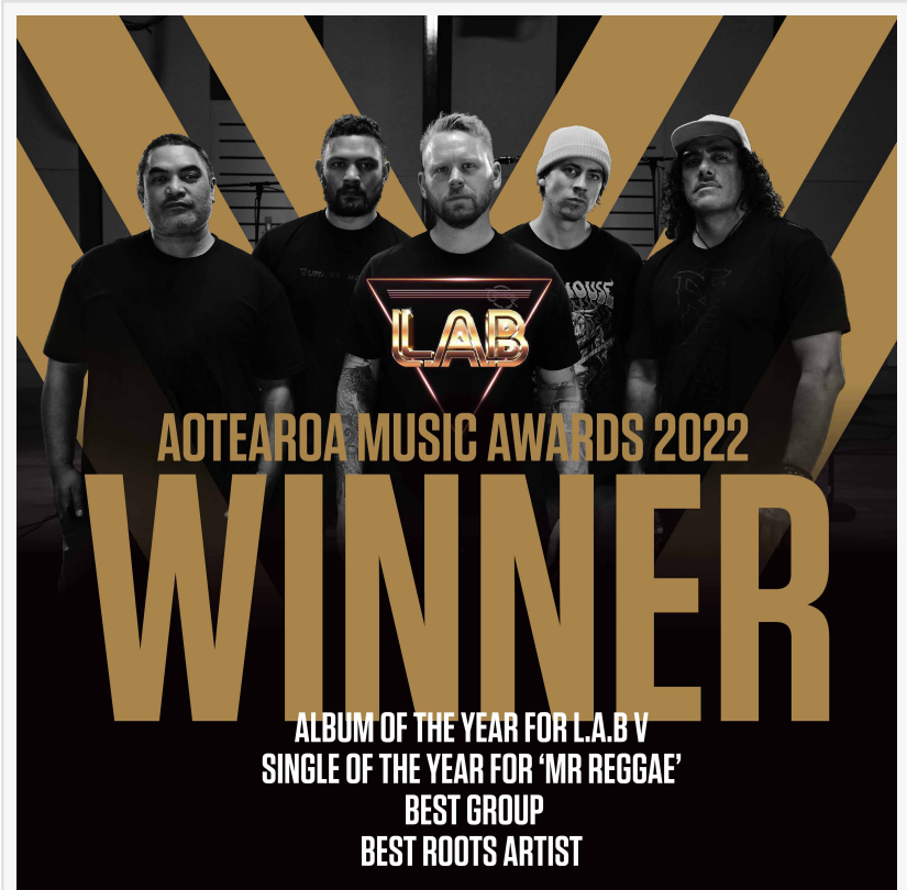
L.A.B win FOUR Aotearoa Music Awards for the second year running

In addition to a further four Aotearoa Music Awards, taking their all-time total wins to 10, the album won Best Record at the Rolling Stone NZ Music Awards, plus three Waiata Māori Music Awards including Best Māori Pop Album, Best Māori Group & Best Song.