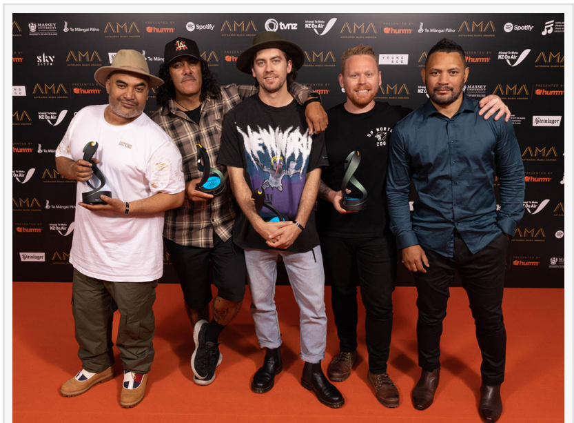
L.A.B win four 2021 Aotearoa Music Awards: Single Of The Year; Album Of The Year; Best Group & Best Roots Artist