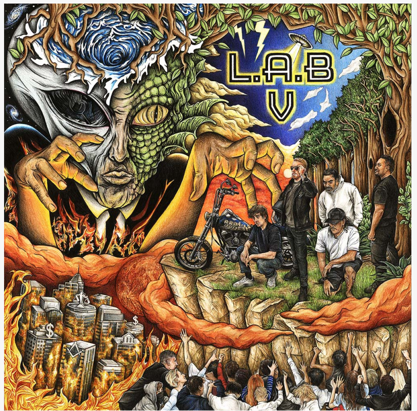
L.A.B V album cover (art: Natalie Mentor)

L.A.B continue to assert themselves as one of NZ's hardest-working acts, with the release of new music to be followed by a run of regional headline shows in NZ.