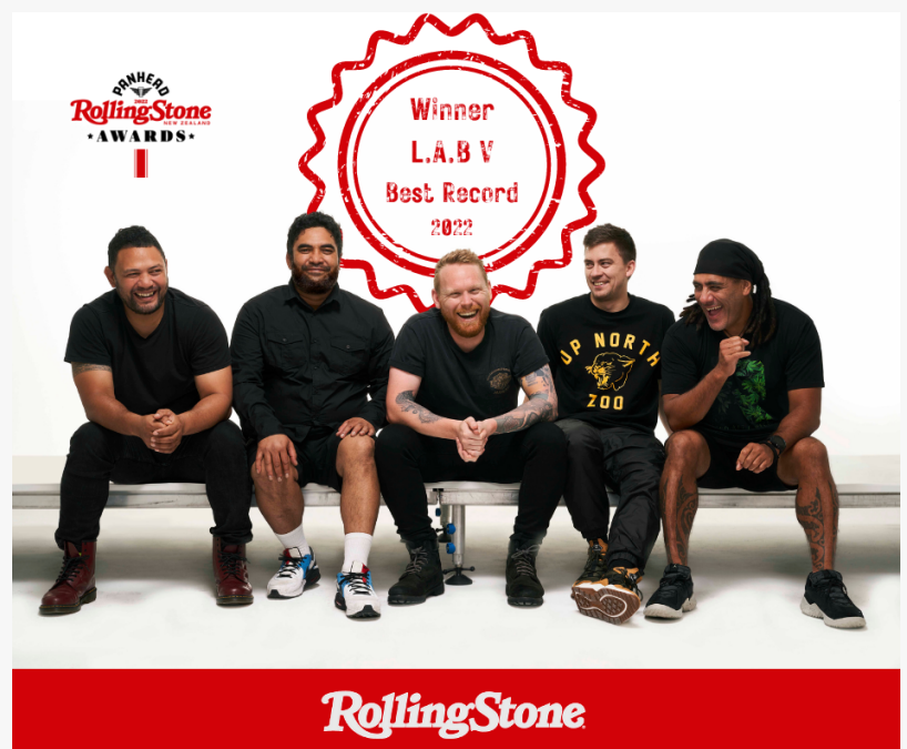
L.A.B win Best Record at NZ RollingStone Awards 2022