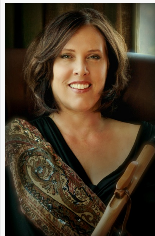
Portrait of World Flutist Ann Licater by D'Arcy Allison-Teasley

Whispers from Earth debuted on radio with five tracks on the "Deep Flutes" program (airing 11.11.22) on Hearts of Space , a syndicated radio show that is heard by approximately 200,000 listeners per week on 176 National Public Radio (NPR) stations.