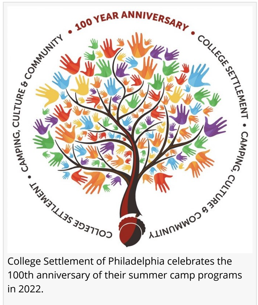
College Settlement of Philadelphia celebrates the 100th anniversary of their summer camp programs in 2022.

During the gala, College Settlement presented three special awards, including: