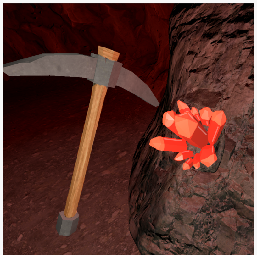
Mine Treasure Challenge icon