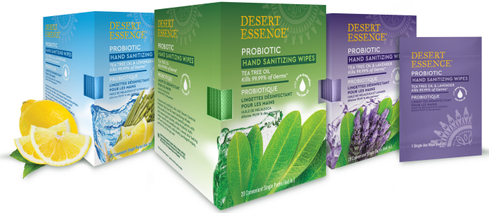
Desert Essence Probiotic Hand Sanitizing Wipes

Desert Essence was founded in 1978 and is a leader in natural personal care. The company