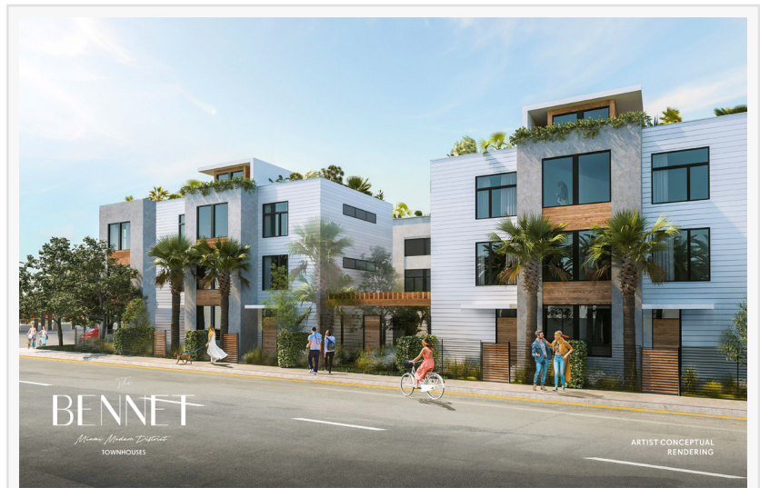
Luxe New Construction Townhomes where Palm Grove Meets The Magic City Innovation District

level includes a two-car garage and welcoming foyer. Level Two features living, dining, gourmet kitchen, one bedroom, and full bath. Level Three incorporates two bedrooms including the main en-suite retreat with walk-in closet and a second bedroom and full bath, plus laundry. Two units include all three bedrooms with all bedrooms on the second level. The exterior design is sleek, modern tropical that is both future-forward and reinforces the Mid-Century Modern architecture the area is known for internationally.