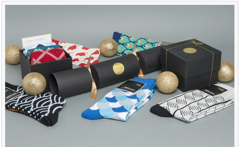
Sock Geeks Sock Subscription

The established e-commerce brand is making its latest ranges available as part of a year-long sock subscription in the UK. A presentation box is sent to the lucky recipient once a month — which includes a sock design that represents the wearer's personality.