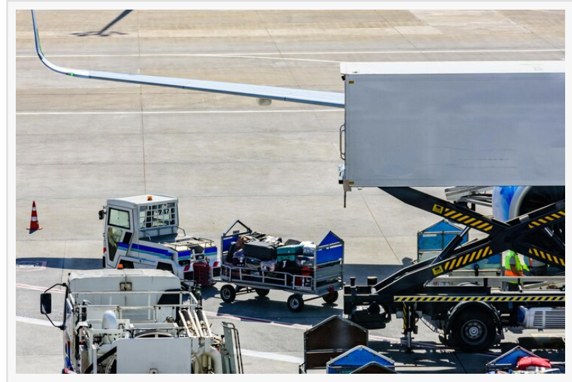
Commercial Airport Baggage Handling System Market

Provides Industry Dynamics, Growth Factors, Key Challenges, Major Drivers & Restraints, Opportunities, And Forecast To 2030. It Will Be A Part Of Quantitative Information For The Mentioned Segments, Regions/Countries And Issues.