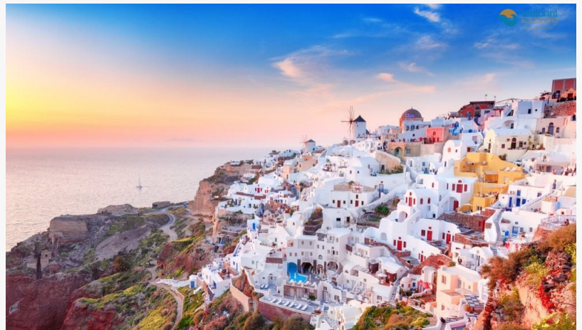
Discover Santorini in Winter