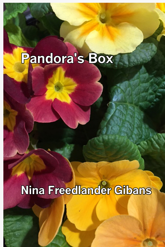
Front cover of Pandora's Box