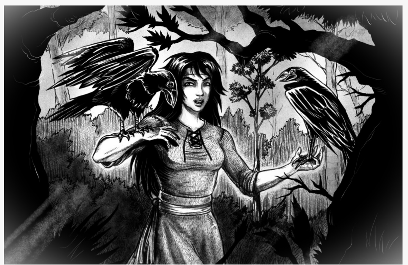
One of the illustrations in the book "The Final Days of Doggerland"

to build a home. But the women and children of the group become captives of the more skilled Bolleborg tribe, led by a ruthless chief, Viggo. One of the captives, Oane, relies on her talent for crafting poisons to survive, while pondering how to reach firm land in the west. But her planned escape may come with a price.