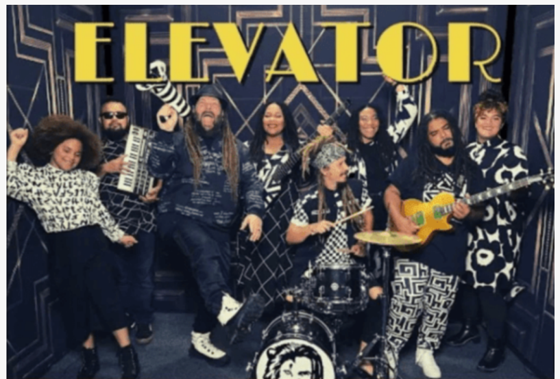
'Elevator' - Christafari Band

UNITED STATES, November 17, 2022 /EINPresswire.com/ -- As trailblazers, Christafari is continually pioneering the genre of Gospel reggae in the U.S. and throughout the world. But the band is more than just musicians; they're "musicianaries" (musical missionaries), spreading the message of hope and salvation globally with a relentless touring and release schedule. To date, they've ministered in 85 nations, all 50 of the United States, and released over 100 music videos.