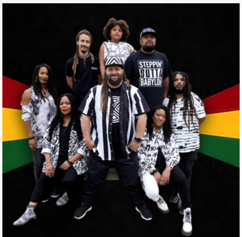
Christafari, Christian Reggae Band