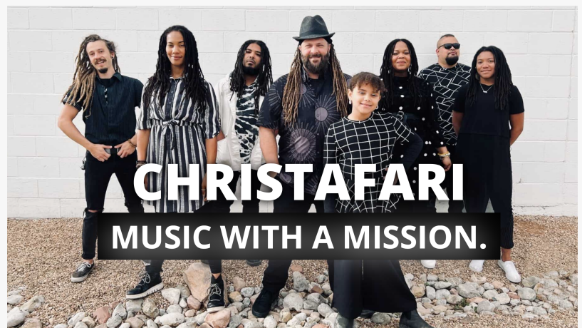
Christafari, Christian Reggae Band