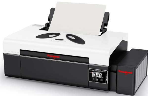
Procolored A4 DTF Printer