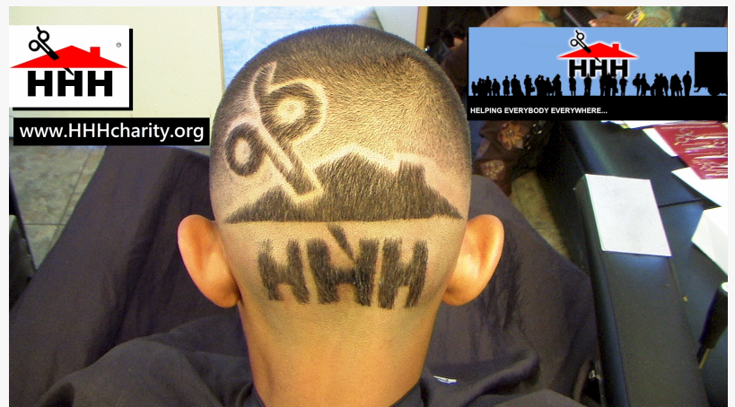
HHH Charity Logo in a Designed Hair Art Haircut