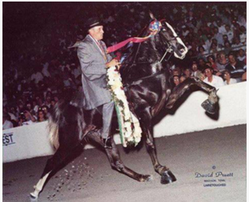
1992 Tennessee Walking Horse 2-Year-Old World Grand Champion JFK